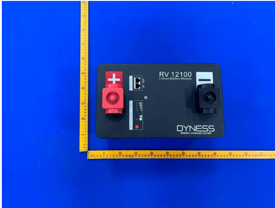
样品图片 (Sample photograph) -2