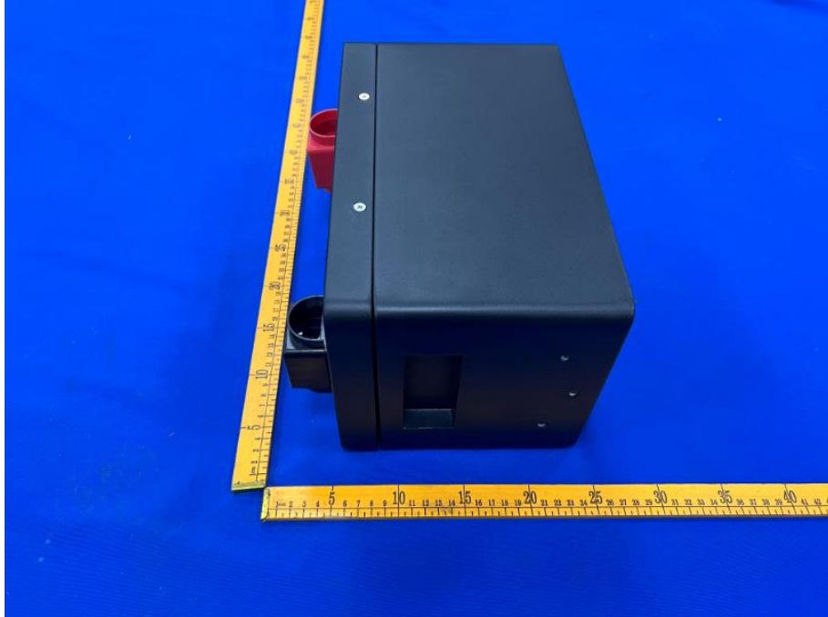
样品图片 (Sample photograph) -4