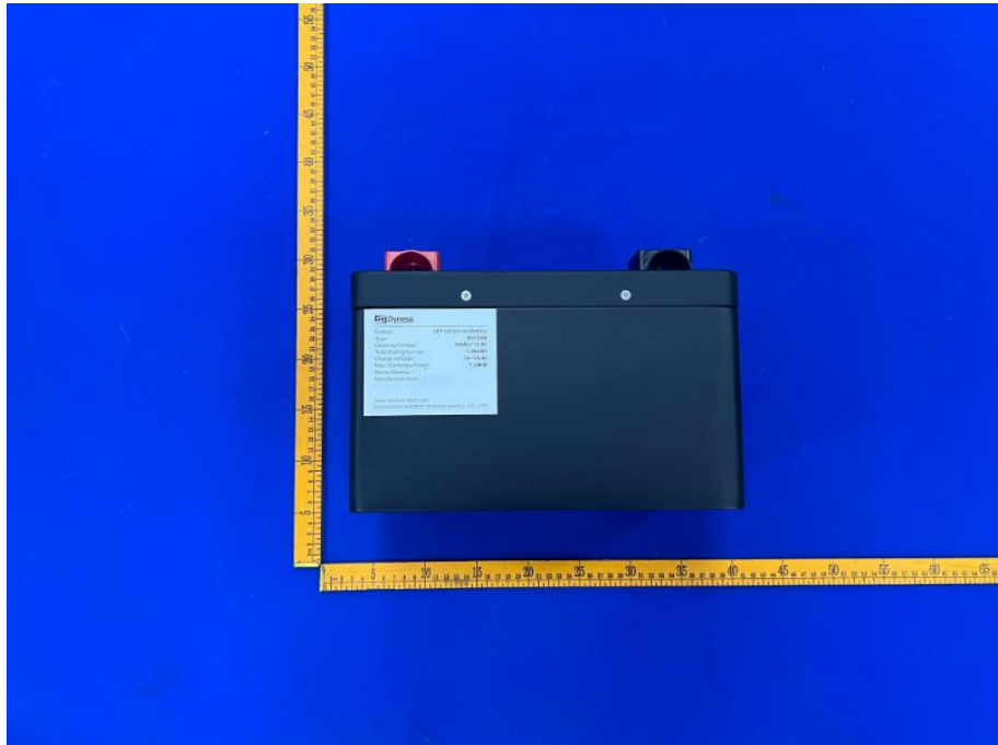
样品图片 (Sample photograph) -6