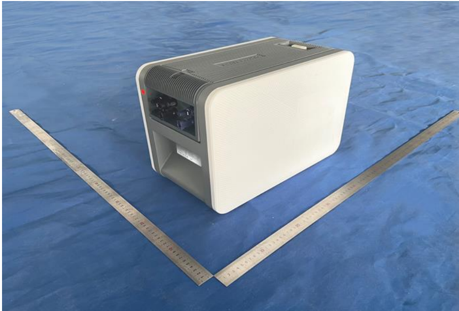
Photo 1 电池组正面 Front view of battery