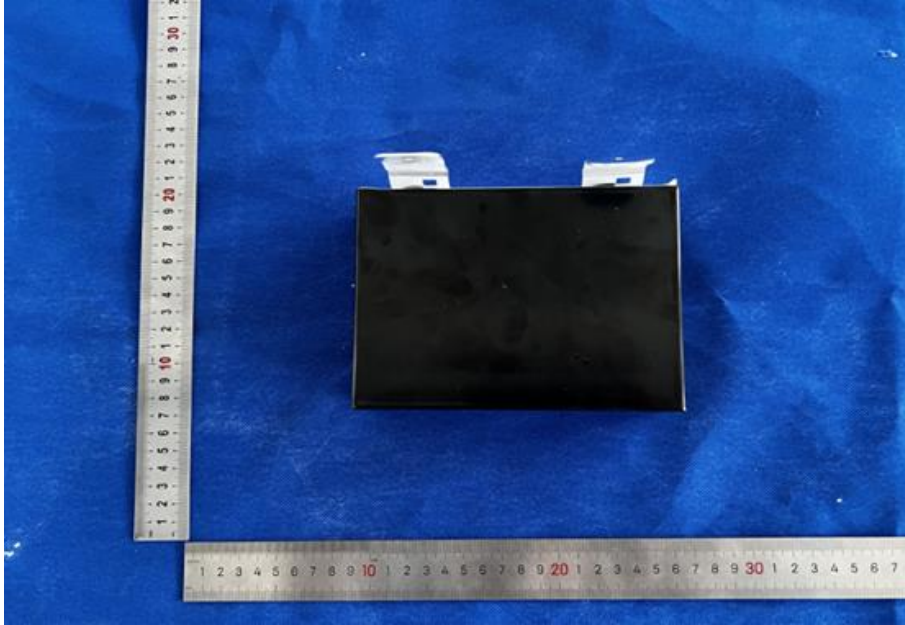
Photo 4 电池正面 Front view of Cell