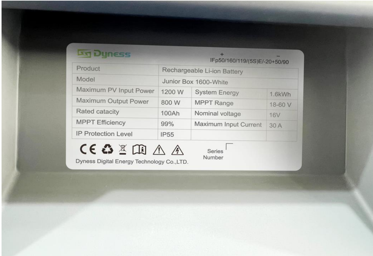
Photo 3 标签特写 Label close-up