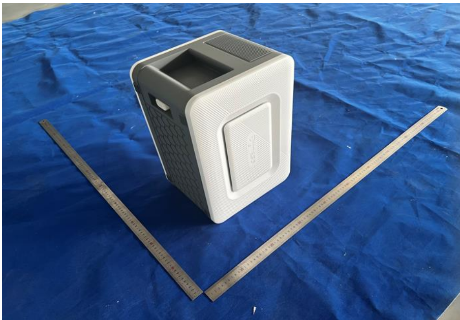
Photo 2 电池组背面 Back view of battery